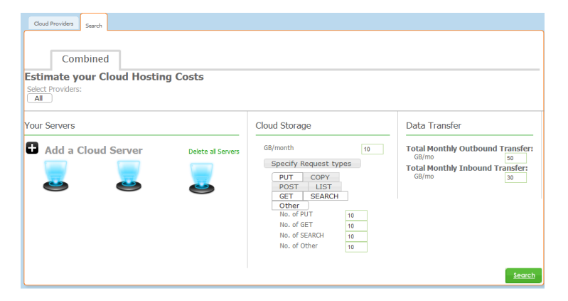
Fig. 4. Screen shot of compute, storage, and network widgets

This layer features rich set of user-interfaces (see Fig 4) that further simplify the selection of configuration parameters related to cloud services. This layer encapsulates the user interface components in the form of four principle widgets including: Compute, Storage, Network, and Recommendation. The selection of basic configuration parameters related to compute services including their RAM capacity, cores, and location can be facilitated through the Compute widget. It also allows users to search compute services by using regular expressions, sort by a specific column etc. Using the Compute widget, users can choose which columns to display and rearrange their order as well. The Storage widget allows users to define configuration parameters such as storage size and request types (e.g., get, put, post, copy, etc.). Service configuration parameters, such as the size of incoming data transfer and outgoing data transfer can be issued via the Network widget. Users have the option to select single service types as well as bundled (combined search) services driven by use cases. The selection results are displayed and can be browsed via the Recommendation widget (not shown in Fig. 4.).