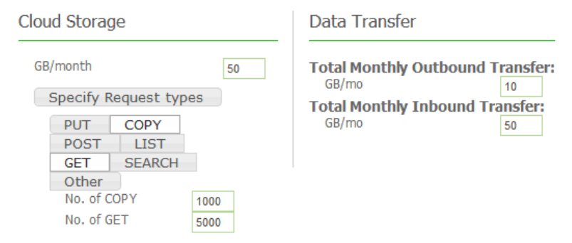
Fig. 5. Service selection criteria set by business analyst

data storage and transfer (network in/network out) requirements. By using CloudRecommender, the analyst would like to find out which of the public cloud providers would be most cost-effective in regards to data storage and transfer costs. For this selection scenario, the analyst inputs the following anticipated usage information for the storage and network services: (i) Data size of 50 GB, 1000 copy requests and 5000 get requests and (ii) data transfer in size of 10 GB and data transfer out size of 50 GB.